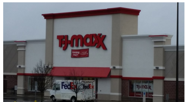
New Commercial Business Butler Crossing